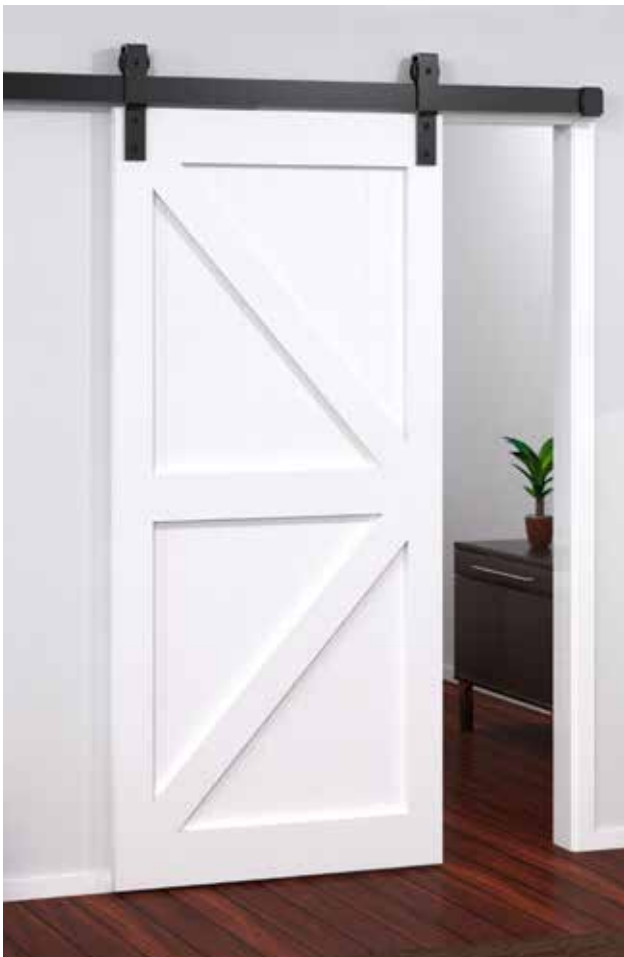
↑ 2 - CS Barn Door Track with white painted timber door.