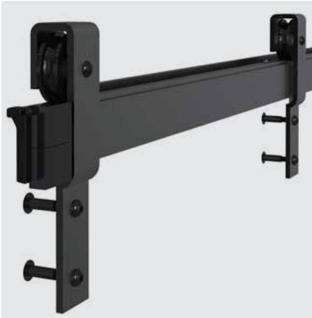
↑ 1 - CS Barn Door Track & Hangers