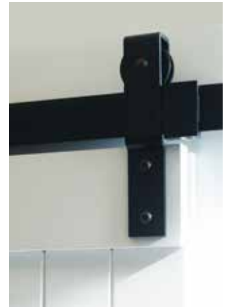
↑ 3 - CS Barn Door Track with painted timber door.

This system has been engineered for quick, easy installation and smooth running for heavy doors.